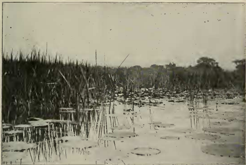
Fig. 4. The second cove south of Biemiller's Cove. The Nymphaea advena Consocias mingled with the Castalia tuberosa Consocias, Typha in the immediate background and Phragmites further back. A type of the feeding ground of Pied-billed Grebes, Black Ducks and Mallards are often flushed from such situations in the early morning. Coots are also found here, and among the bordering vegetation Florida Gallinules may be found in summer.

This is the commonest of the larger ducks, if, indeed, it is not the